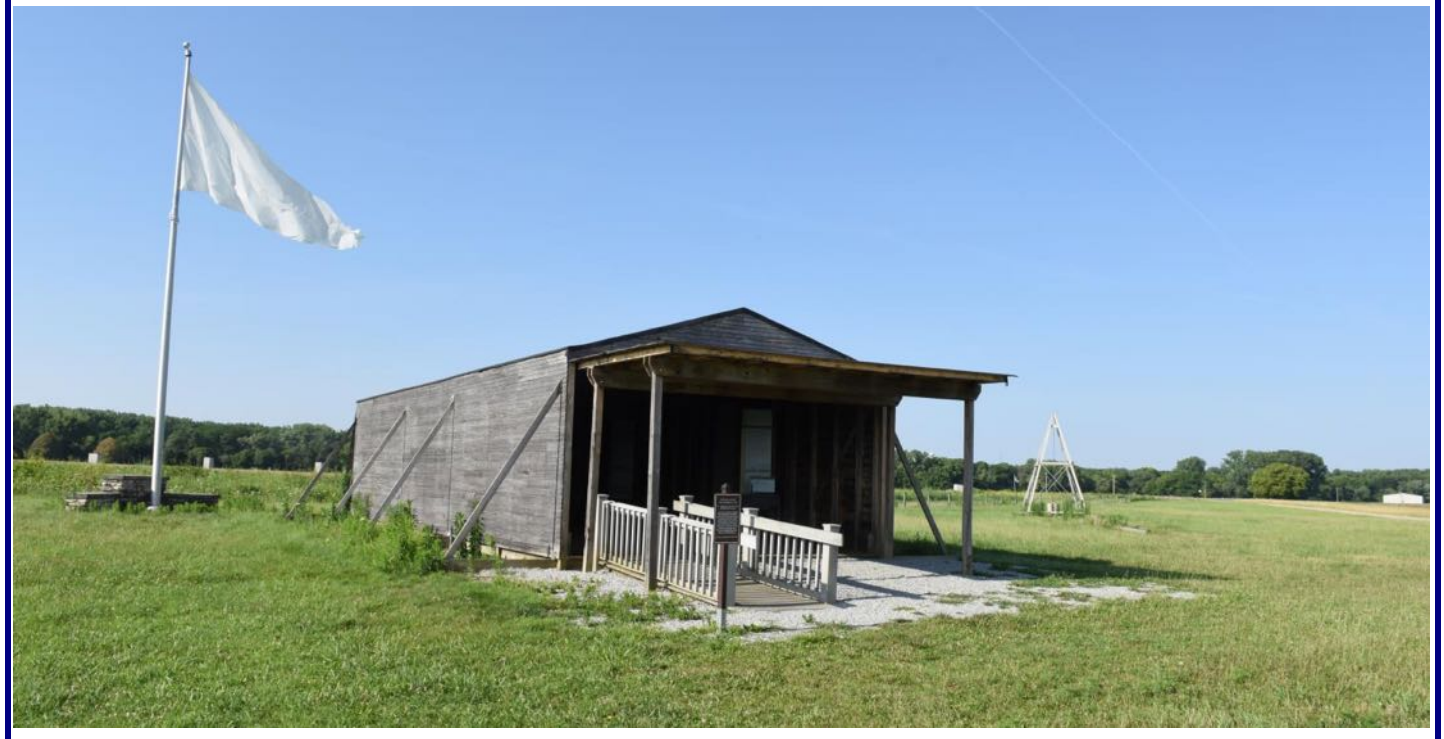
The Wright Brothers' original hangar, with the launch tower in the background

could now fly Figure 8's and other basic maneuvers. Despite the inherent danger, the brothers persevered as they did with Wright Flyer I over the course of 150 flights. Their work culminated in the Wright Flyer III, which they deemed the world's first practical-use airplane. By 1908 they had an aircraft they were ready to demonstrate to the world, which they would wow European audiences with much more than they would American ones.